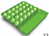
12 Count Tri-Fold