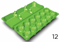
12 Count Bi-Fold

12 count tri-fold, 12 count bi-fold, 18 count bi-fold, and 24 count bi-fold