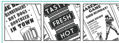
Newspaper™ (three rotating design)

*Ounce sizes are approximate dry weight measurements