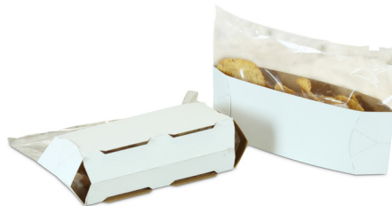
Salty and Sweet Snacks