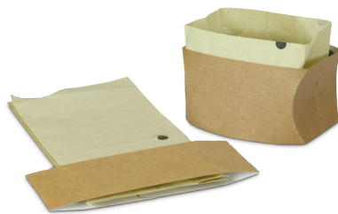
Hot and Cold Breakfasts