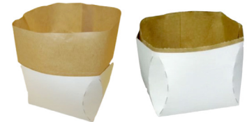
Pastas or Grains